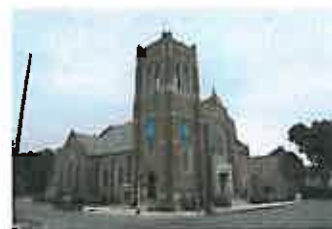
Calvary Lutheran Church "In the City for Good!"

At a recent gathering I was approached by a retired ELCA pastor who had heard that I was serving at Calvary. He said, "I'd never been in the building at Calvary before,